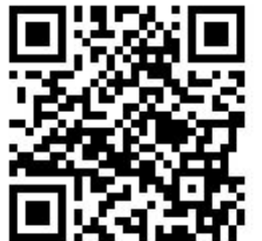
QR code for CLUB 3:16 web page